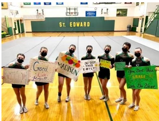
2020 IHSA State Third Place cheer team

On March 6th, the St. Edward 2020 IHSA State Third Place competitive cheer team prepared and submitted a winning routine for the Barrington Virtual Sectionals.