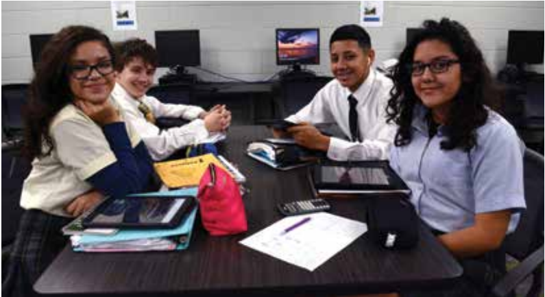
Students study in the newly remodeled Learning Resource Center.

St. Edward Central Catholic education prepares our students for success in their post-secondary education. The composite ACT score for the class of 2017 was 23.2, exceeding the state composite of 21.4 and the national composite of 21. ■