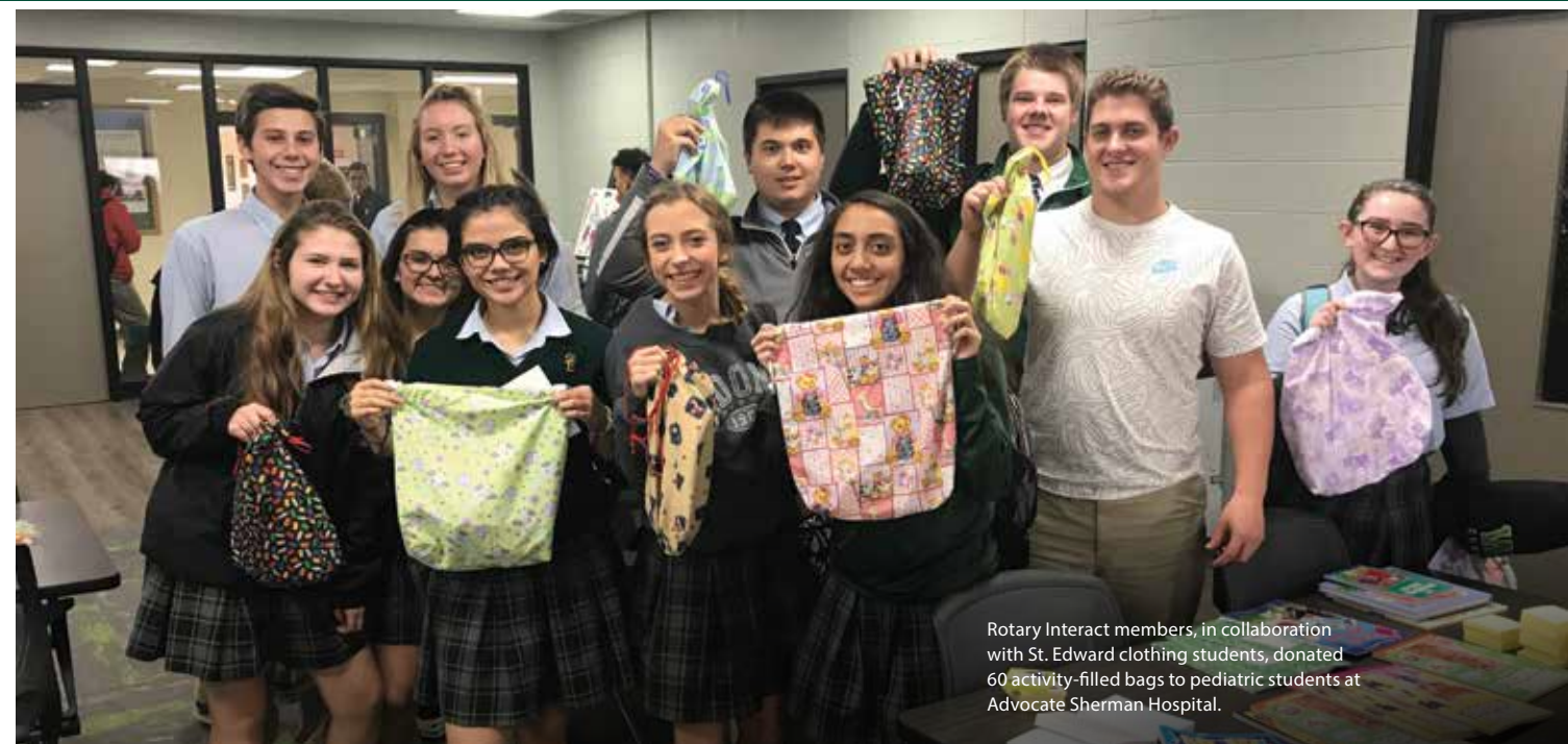
Rotary Interact members, in collaboration with St. Edward clothing students, donated 60 activity-filled bags to pediatric students at Advocate Sherman Hospital.