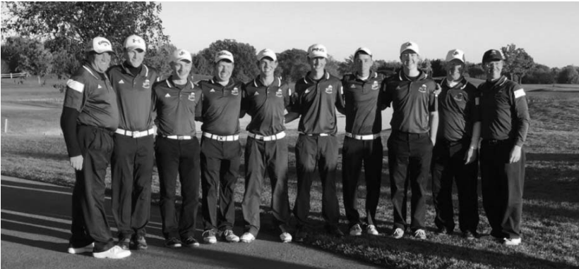
Boy's State Golf Team