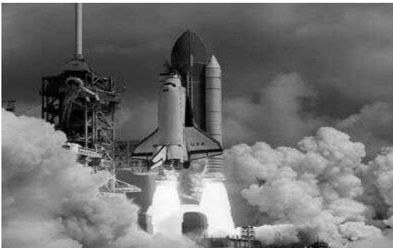
A space shuttle launch in Florida. NASA

On the New Scientist website, there is a video of the experiment they conducted of someone shooting the material with a speeding bullet. Within seconds, the bullet is caught by the “skin” and completely heals itself, sealing the bullet within the material.