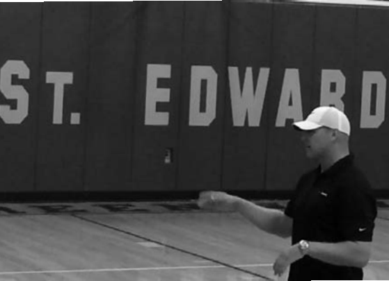
Urlacher addresses the football and cheerleading teams in the St. Edward gym.