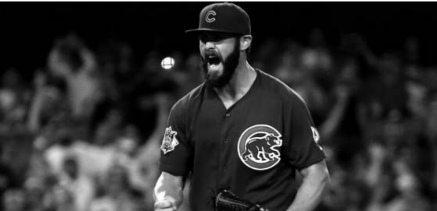
Jake Arrieta celebrates a strikeout during the NLCS against the New York Mets.

Although the Cubs were not able to make their dreams come true, they are a young team with incredible talent and a bright future.