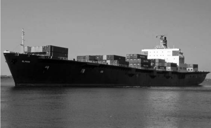
The El Faro Cargo Ship was built in 1975 and has been sailing ever since.

The owners of El Faro, TOTE Maritime Puerto Rico, thanked the Coast Guard in a statement for their assistance in the search. “We continue to hold out hope for survivors. Our prayers and thoughts go out to the family members and we will continue to do all we can to support them.”