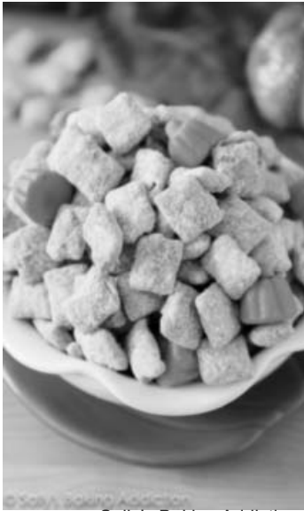
Sally's Baking Addiction