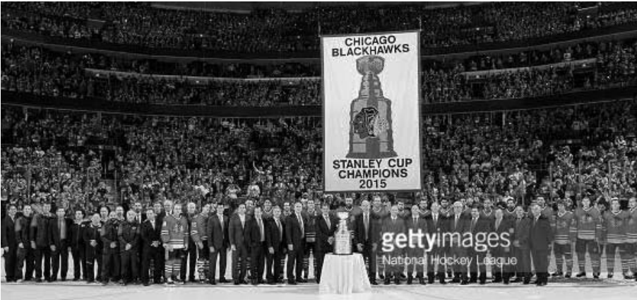
Chicago Blackhawks raising the banner at the United Center during the home opener