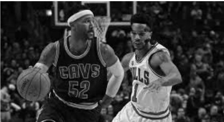
Derrick Rose, in the Bulls home opener on Oct. 27, wearing a mask due to an orbital fracture.