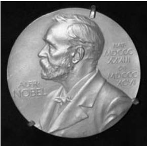
The Nobel Prize for Medicine.

Omura, Tu, and Campbell have made tremendous discoveries in the field of medicine.