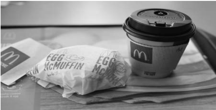
Egg McMuffin breakfast sandwich.

The company is confident though, they can get things figured out quickly and make a smooth transition into the ‘McMuffin for dinner’ era.