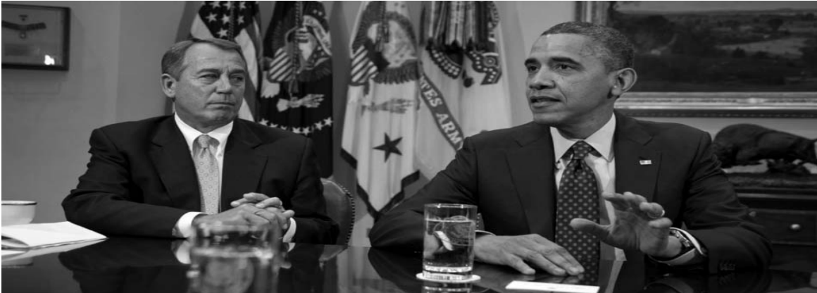
Former Speaker John Boehner (left), and President Obama

One of the most helpful and new areas of funding will go to making a college education more accessible. A tuition-free community college for responsible students, a partnership between community colleges and the federal government will help over 9 million students with starting their journey to a degree. Another improvement is a re-design on student loans. The budget proposes to start a pay as you earn repayment plan, so that repayment does not become unmanageable.