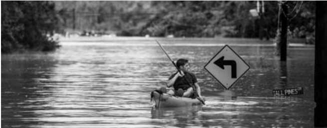
Water was higher than street signs.

The state has received a lot of help and support from people all over the country. Homes, churches, and schools have experienced a lot of damage. If you want to help the Salvation Army support these communities, you can donate online or by texting STORM to 51555.