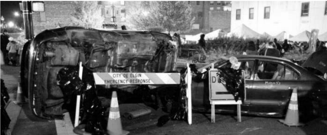
Two cars flipped over as people take shelter from the infected at the annual Nightmare on Chicago street event downtown Elgin.