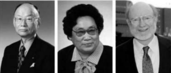
Nobel Prize Committee

The assembly also noted how the treatment of river blindness and lymphatic filariasis is so successful that the diseases have almost been eradicated.